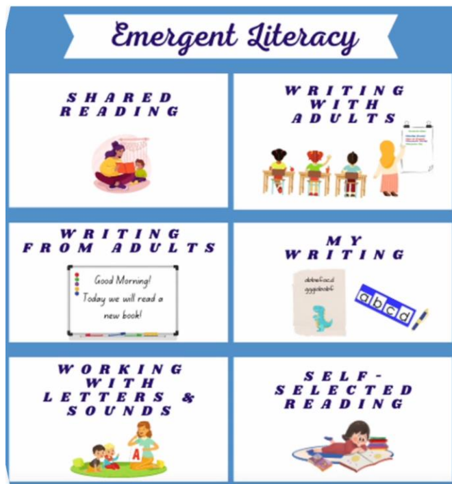
The six daily emergent literacy interventions.

There are six emergent literacy interventions which students need daily access to. Don't be afraid to jump in and get started! It is better to do them all imperfectly than some perfectly.